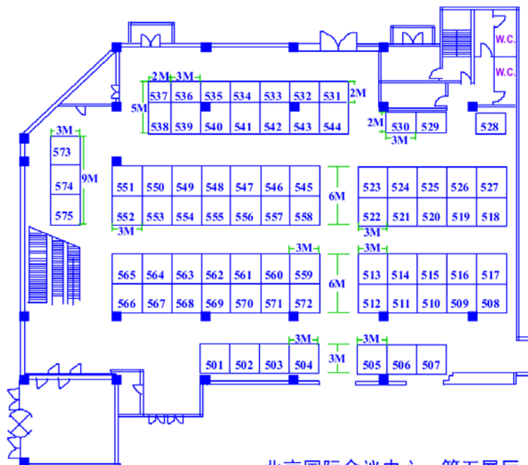
北京国际会议中心 第五展厅 Hall 5, BICC